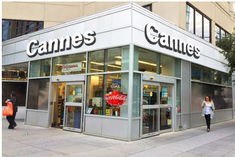
Convenience chain store / Pharmacy chain store