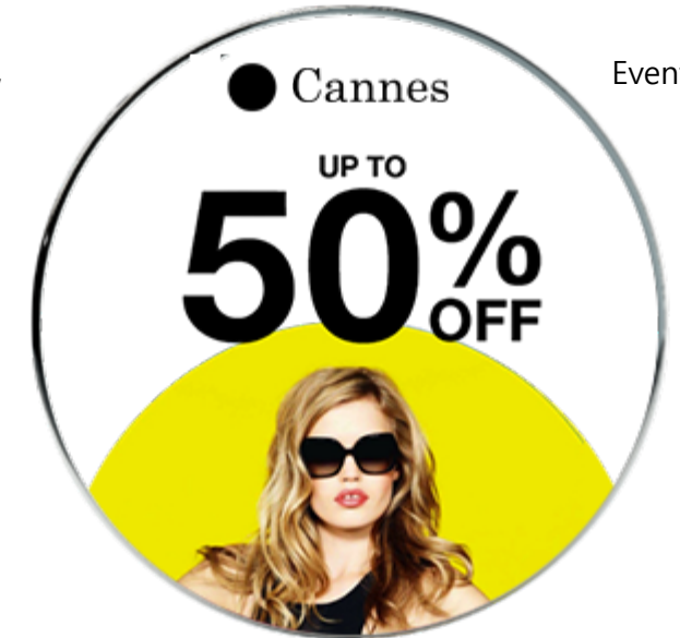
Event / Sale