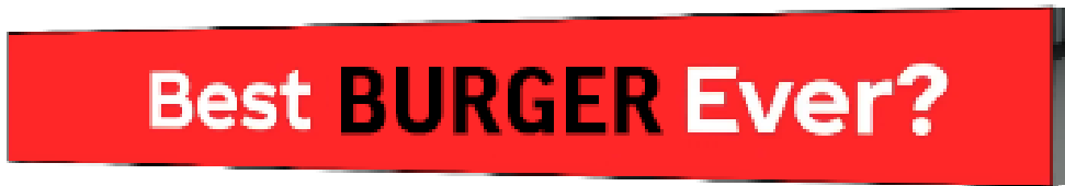
Sign 3 5 panels