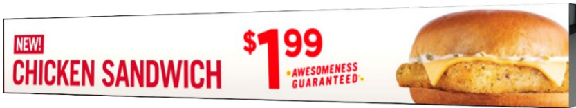
Sign 2 4 panels